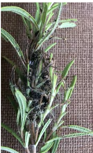
Rosemary infested by Southern Purple Mint Moth Larvae