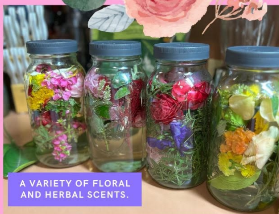
A VARIETY OF FLORAL AND HERBAL SCENTS.

Just collect a blend of herbs and flowers to fill a half-gallon mason jar about halfway to two-thirds. Then add 1/2 cup of sugar, fill with water, and place a lid loosely on top. You want it to "breathe." You could also just cover the top with a scrap of fabric and a rubber band.