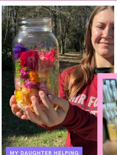
MY DAUGHTER HELPING ME COLLECT HERBS AND FLOWERS!